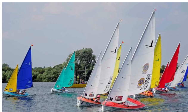
A Combined 303 Race Start