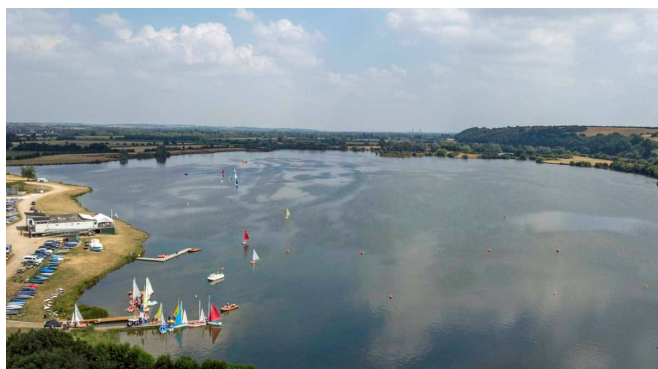
Notts County SC

The 2018 Hansa UK Nationals Six FPS sailors arrived in July to a warm welcome and even warmer weather at the scenic Notts County Sailing Club. With a 29 boat entry across the 4 classes the racing was competitive and hard work as we had very little wind for the first two days, a more reasonable wind set in on Sunday morning as the mercury hit the 30's.